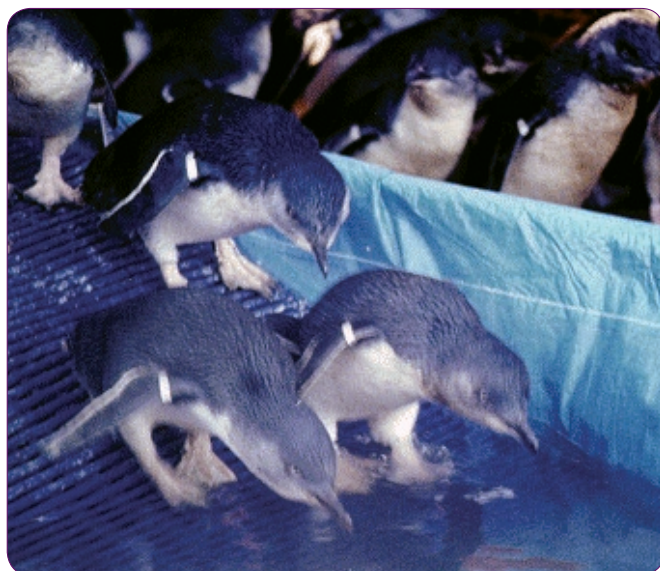
Australian Maritime Safety Authority

As of April, Taiwan’s cruel “wet” markets, at which live poultry are sold and slaughtered, are no longer legal. Horrific conditions typical at these markets were documented and exposed through a campaign by the World Society for the Protection of Animals and the Environment and Animal Society of Taiwan. Stacked in cages on top of each other, animals often struggled to move with broken wings and legs, and many were thrown into scalding tanks to be de-feathered alive. The ban will also help prevent the spread of avian flu. 🐾