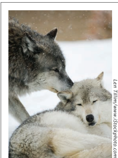
Anyone can kill wolves—for any reason—across 88 percent of Wyoming.

After spending millions of taxpayer dollars to recover gray wolves from the brink of extinction over the last decade, the FWS appears poised to allow their systematic extermination for a second time. Wildlife advocacy organizations have filed several lawsuits challenging the US government's actions to remove federal protections for gray wolves across the country. 🐾