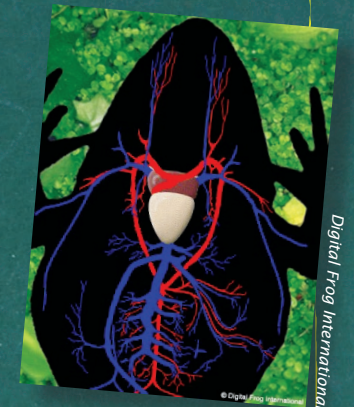
Digital Frog International