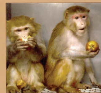
Refinement of Housing and Handling Practices for Caged Nonhuman Primates