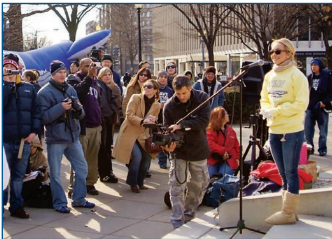
Addressing a crowd at Washington D.C.'s Dupont Circle, Hayden Panettiere speaks about her passion to save the whales and other marine animals.

As regular AWI Quarterly readers know, AWI joined forces with The Whaleman Foundation last year to launch the Save the Whales Again! campaign. This January, campaign spokesperson Hayden Panettiere, who plays the role of cheerleader Claire Bennet on the NBC hit series “Heroes,” visited Washington, D.C. to promote our efforts against a resumption of commercial whaling and to raise the issue with Congressional leaders.