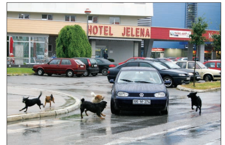
Stray dogs are common in many areas of Bosnia.

BaZIL is surrounded by a high-quality fence and consists of 16 completed DELTA shelters and six partially finished shelters, each enclosed by its own fence. Three layers of