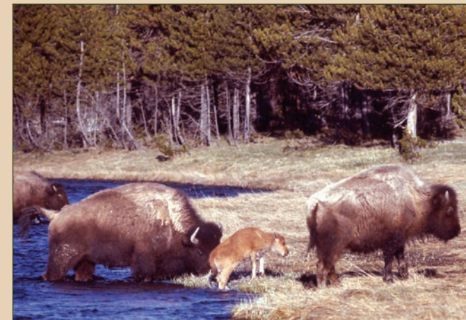
Due to an unjustified fear of disease transmission, over 1,500 bison have been killed outside Yellowstone this year.