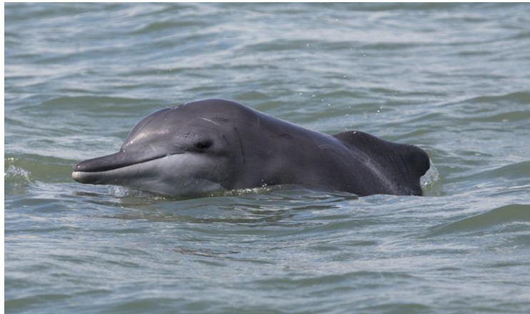
Fig. 4. An Atlantic humpback dolphin surfaces in the Rio Nuñez Estuary, Guinea, showing the characteristic hump of the species, on which the small rounded dorsal fin sits.

The only population estimate based on quantitative methods is for the Angola stock, which inhabits the Flamingoes area. This stock has been studied with photo-identification methods and is thought to contain only 10 individuals (Weir 2009, p. 327). Collins (2015, p. 53) and Collins et al. (2017, Population) reviewed all available data on the population biology of this species and concluded that the total global population of the species is almost certainly less than 3,000 individuals. Assuming about 50% mature individuals, this would make the mature population about 1,500 individuals (Collins et al. 2017, Assessment Information). Although this is speculative, it is based on a thorough review of the best available data and new research from the past few years has not provided evidence to undermine this assumption.