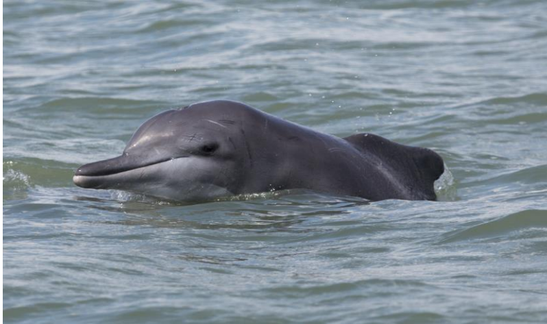
Atlantic humpback dolphin surfacing in nearshore waters of the Rio Nuñez Estuary, Guinea.