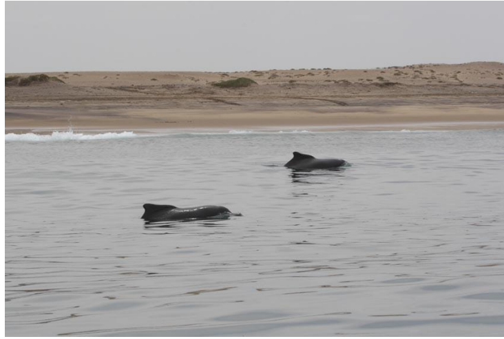
Fig. 3. Two Atlantic humpback dolphins move along shore near the coastline of Angola.

627; Van Waerebeek et al. 2004, p. 73; Weir and Collins 2015, p. 103). Despite some previous speculation, this is not a freshwater species.