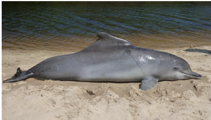
Fig. 1. A young specimen of the Atlantic humpback dolphin, which was caught in a gillnet.

The Atlantic humpback dolphin, Sousa teuszii , is one of four known species of humpback dolphins in the genus Sousa (Mendez et al. 2013, p. 5936; Jefferson and Rosenbaum 2014, p. 1494). This species is the only humpback dolphin found in the Atlantic Ocean and occurs along the coast of western Africa. Sousa teuszii was first described in the late nineteenth century by Kükenthal (1892, p. 442), who based his description primarily on perceived differences in the skull of the holotype (collected in Cameroon), from other humpback dolphins known at the time. The distinctness of the species from the others has been questioned over the years (see Ross et al. 1996, p. 1), but recent work involving adequate samples of both morphometric (Jefferson and Van Waerebeek 2004, p. 3) and molecular (Mendez et al. 2013, p. 5936) characters has confirmed that it is a species separate from the other three of the genus Sousa : S. plumbea (Indian Ocean humpback dolphin), S. chinensis (Indo-Pacific humpback dolphin), and S. sahulensis (Australian humpback dolphin) (Jefferson and Rosenbaum 2014, p. 1494).