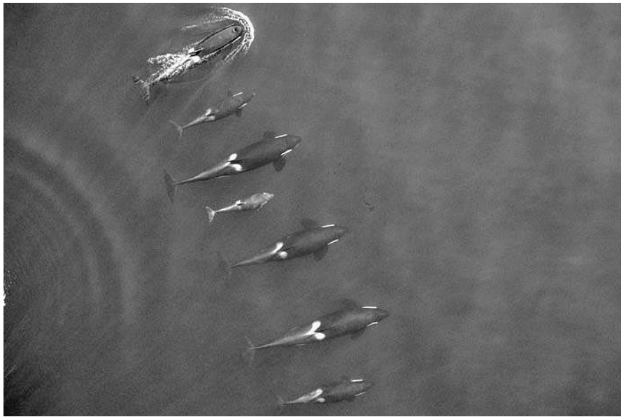
Figure 2. A drone's view of a family of orcas in the Pacific Northwest.

Here's some more new technology. This is from drones. 82