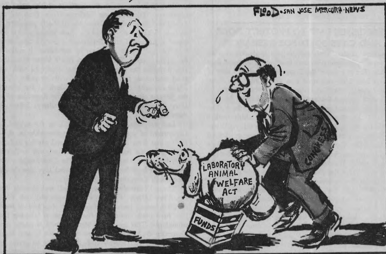
Cartoon from THE SAN JOSE MERCURY NEWS, JULY 16, 1967